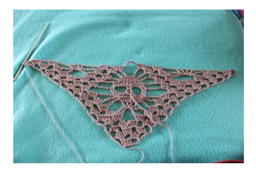
19. Ch 8. 4 dc in space. ch 2. 4 dc in space. Ch 8. 11 sc on the skull. (2 on the chain, 1 into the dc. 1 round the chainspace, 1 into the second dc. 1 round the ch-space. 1 into the third dc. 1 round the ch-space. 1 into the 4th dc. 2 on the chain= 11 sc). Ch 8. 4 dc in space. Ch 2. 4 dc on chain. Ch 2. 4 dc on chain. Ch 2. 4 dc in space. Ch 8. 11 sc on the skull. ch 8. 4 dc in space. Ch 2. 4 dc in space. Ch 2. 4 dc in space. Ch 2 and 1 dtr.)