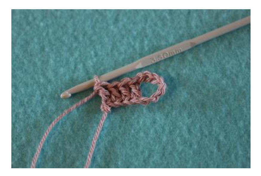
2. Chain 2, then make one double treble crochet stitch in the very first chainstitch you made. Turn after every round and make the next round on the other side

1. chain 12, make 1 double crochet each in the 4 first chain stitch you made