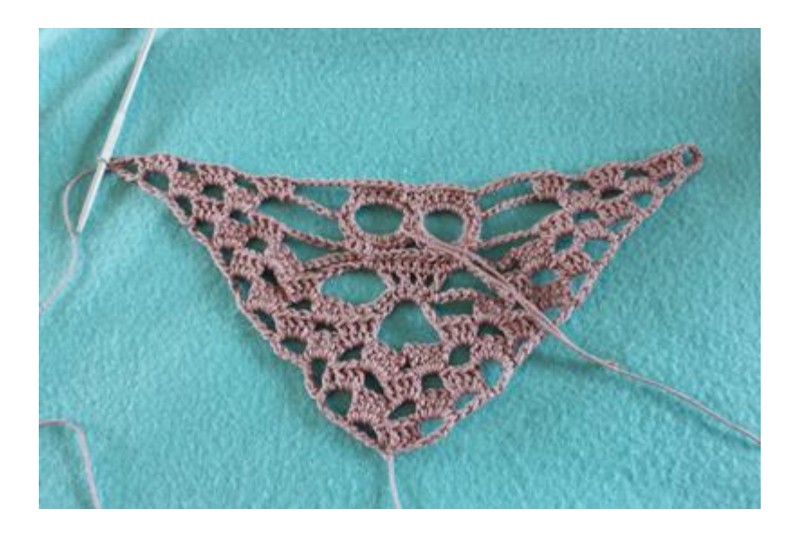
15. Ch 8. 4 dc in space. Ch 2. 4 dc i space. ch 2. 4 dc in space. ch 2. 4 dc round the chain. Ch 6. 8 sc onto the skull. Ch 6. 4 dc round the chain. ch 2. 4 dc in space. Ch 2. 4 dc in space. Ch 2 and 1 dtr