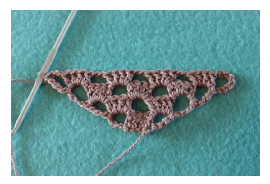
6. Time to begin to make the first skull. Ch 8. 4 dc in space. Ch 2. 4 dc in space. Ch 9. Skip one space and make 4 dc in next. Ch 2. 4 dc i next space. Ch 2 and 1 dtr.)

5. Ch 8. 4 dc in space. Ch 2. 4 dc i space. Ch 2. 4 dc in space. Ch 2. 4 dc in space. Ch 2 and 1 dtr)