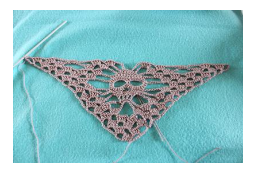
18. Ch 8. 4 dc in space. ch 2. 4 dc in space. Ch 6. Dc, ch 1, dc, ch 1, dc, ch 1, dc on to the skull. Ch 6. 4 dc in space. Ch 2. 4 dc round chain. Ch 9. 4 dc round chain. Ch 2. 4 dc in space. Ch 6. Dc, ch 1, dc, ch 1, dc, ch 1, dc onto the skull. Ch 6. 4 dc in space. ch 2. 4 dc in space. Ch 2 and 1 dtr.)