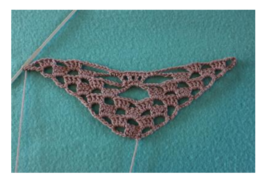
10. Ch 8. 4 dc in space. Ch 2. 4 dc in space. And here it comes... Ch 10 4 sc in the 4 first stitches on the skull. Chain 5 and skip 3 stitches on the shawl. 4 sc on the skull. Turn.

9. Ch 8. 4 dc in space. Ch 2. 4 dc in space. Ch 8. And make 11 sc on the skull. (2 on the chain, 1 into the dc. 1 round the chainspace, 1 into the second dc. 1 round the ch-space. 1 into the third dc. 1 round the ch-space. 1 into the 4th dc. 2 on the chain= 11 sc) ch 8. 4 dc in space. Ch 2. 4 dc in space. Ch 2 and 1 dtr.)