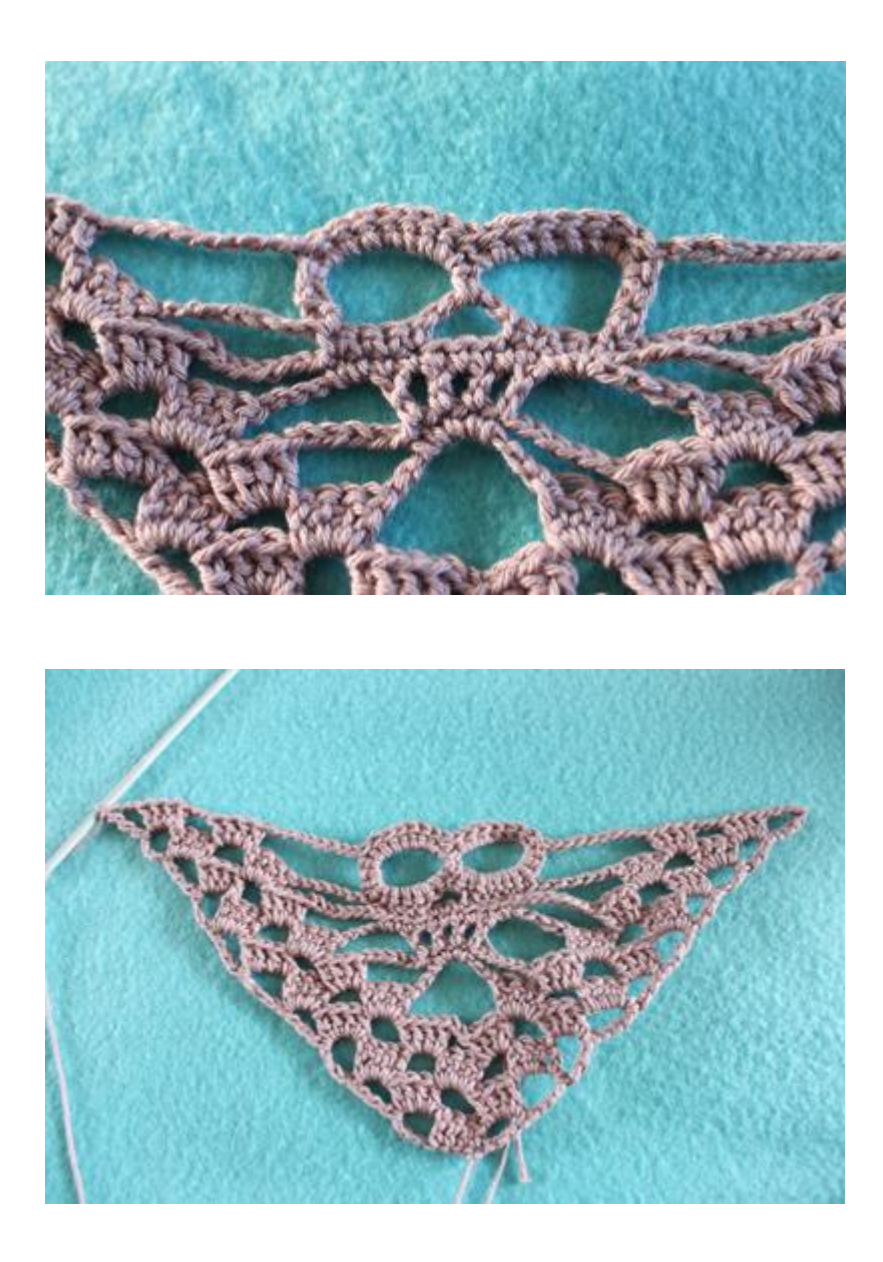
14. Ch 8. 4 dc in space. Ch 2. 4 dc i space. ch 2. 4 dc round the chain. Ch 6. 12 sc onto the skull( in the middle) Ch 6. 4 dc round the chain. ch 2. 4 dc in space. Ch 2. 4 dc in space. Ch 2 and 1 dtr.