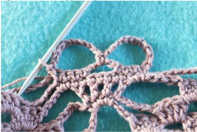
12. Now crochet 10 sc around each arch. Then a sl st. Chain 10. 4 dc in space. Ch 2. 4 dc in space. Ch 2 and 1 dtr.

11. Chain 10 and make a sc around the chain in the middle. Chain 10 and crochet a slipstitch into the very first sc you made. Turn.