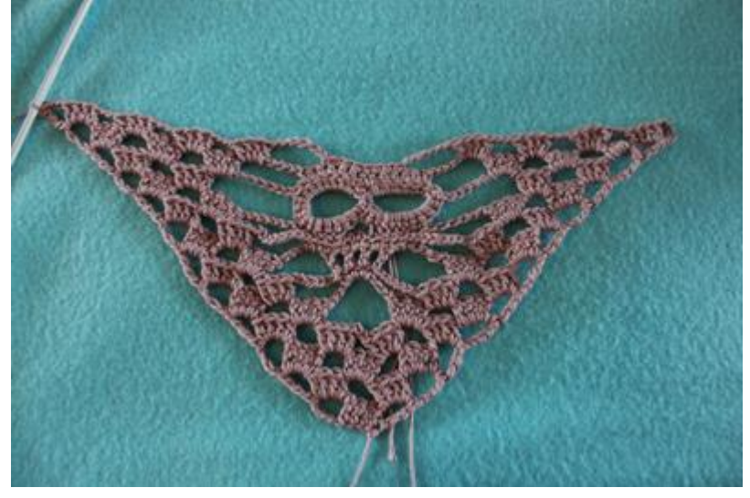
16. New skulls on the sides!! Ch 8. 4 dc in space. Ch 2. 4 dc i space. ch 9. Skip one space and make 4 dc in next space. ch 2. 4 dc round the chain. Ch 6. 6 sc onto the skull. Ch 6. 4 dc round the chain. ch 2. 4 dc in space. Ch 9. Skip one space and make 4 dc in next space. Ch 2. 4 dc in space. Ch 2 and 1 dtr)