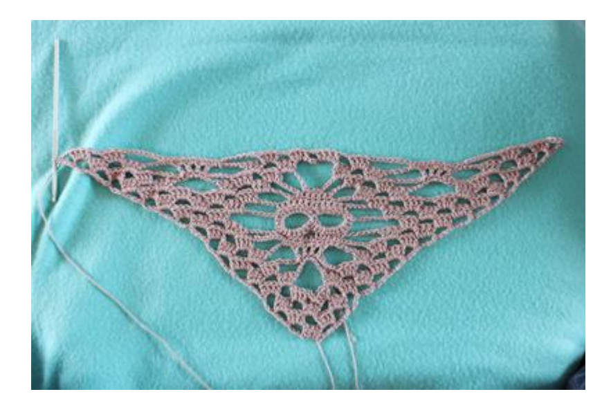
And the next time you have 4 groups of dc in a row on the sides and in the middle, then it's time to start on three new skulls on the next round.

In the end, to get a nice looking ending, instead of beginning crocheting new skulls I continued with 4 dc and 2 chains between. Like this: