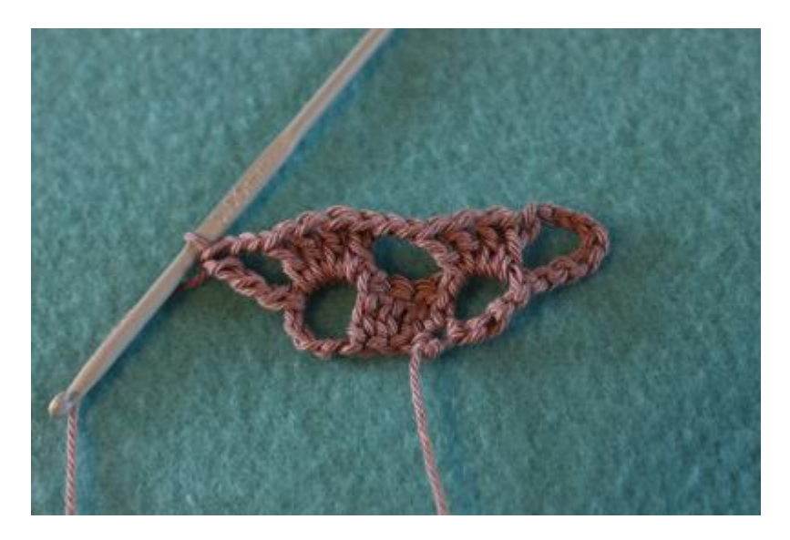
4. Chain 8. 4 dc in space. Ch 2. 4 dc in space. Ch 2. 4 dc i space. Ch 2 and 1 dtr.)

3. Chain 8. 4 dc in the first space. Chain 2. 4 dc in the second space. Chain 2 and 1 dtr